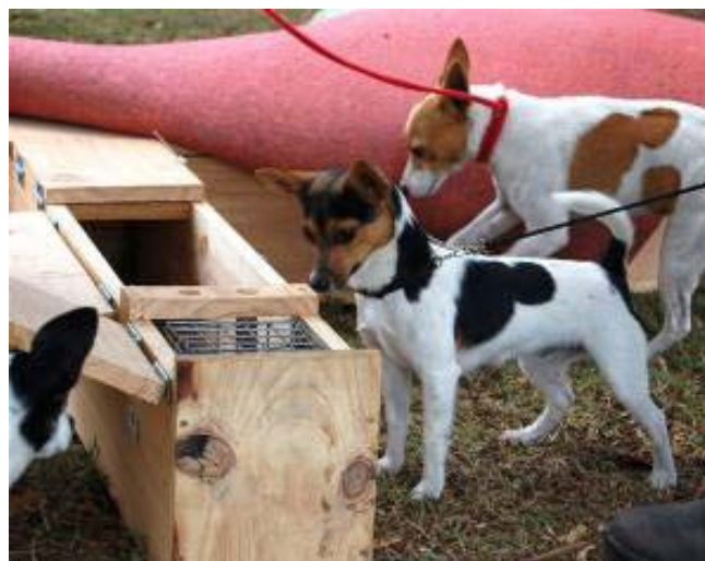
Fig 19 Introduction to Earthdog Activities