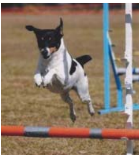
Fig 18 Agility upright hurdle