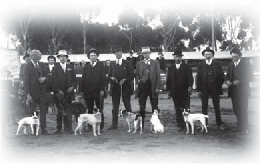
Fig 4. A hunting party probably in Western Victoria in the early 1900's

Small ratting terriers that were used to kill the rats and mice on board early sailing ships came to Australia with our first settlers. Once the ships docked, rats and other vermin escaped into our pristine countryside. Originally, many of these dogs would have been left behind specifically to kill this foreign vermin. But as Australia became more populated, these little dogs became established throughout the country not only as vermin killers, but also a popular family companions. These terriers became known as the "mini foxies".